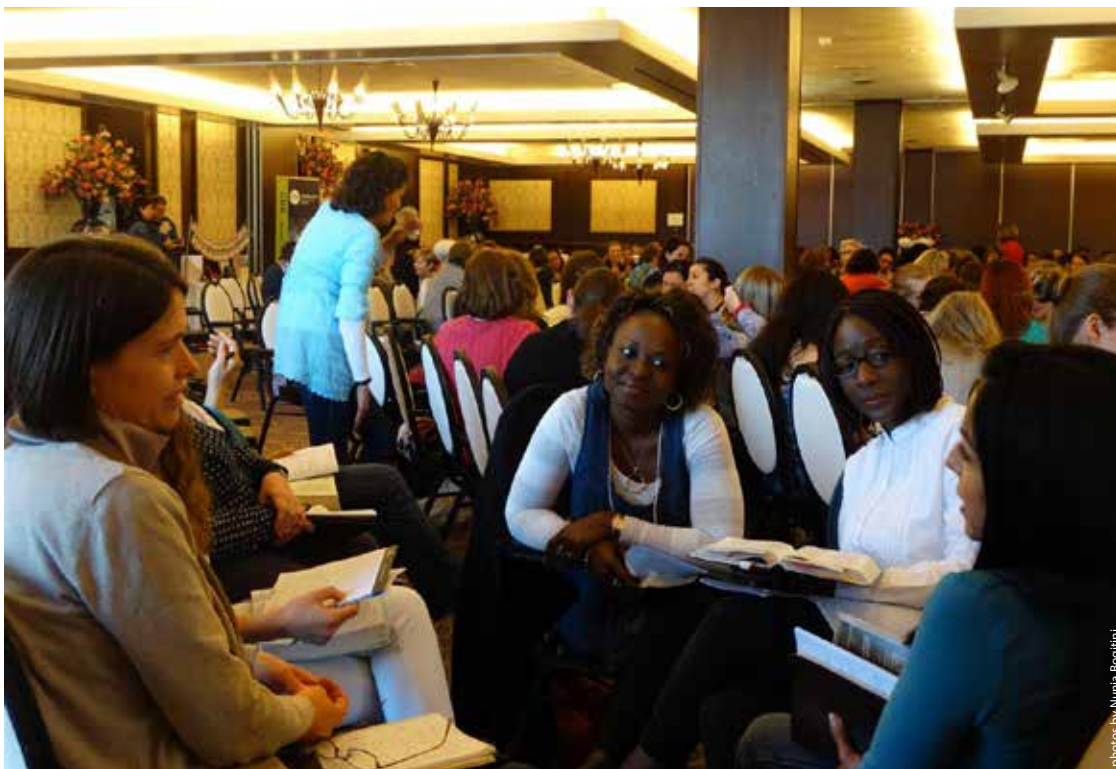
Women at the conference share and pray together.