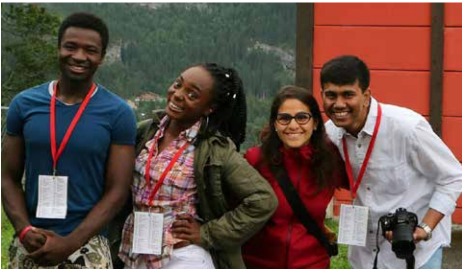
Part of the ACF Youth Leadership team.